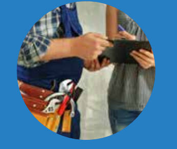
SCHEDULED PREVENTIVE INSPECTIVE SERVICE (SPIS)